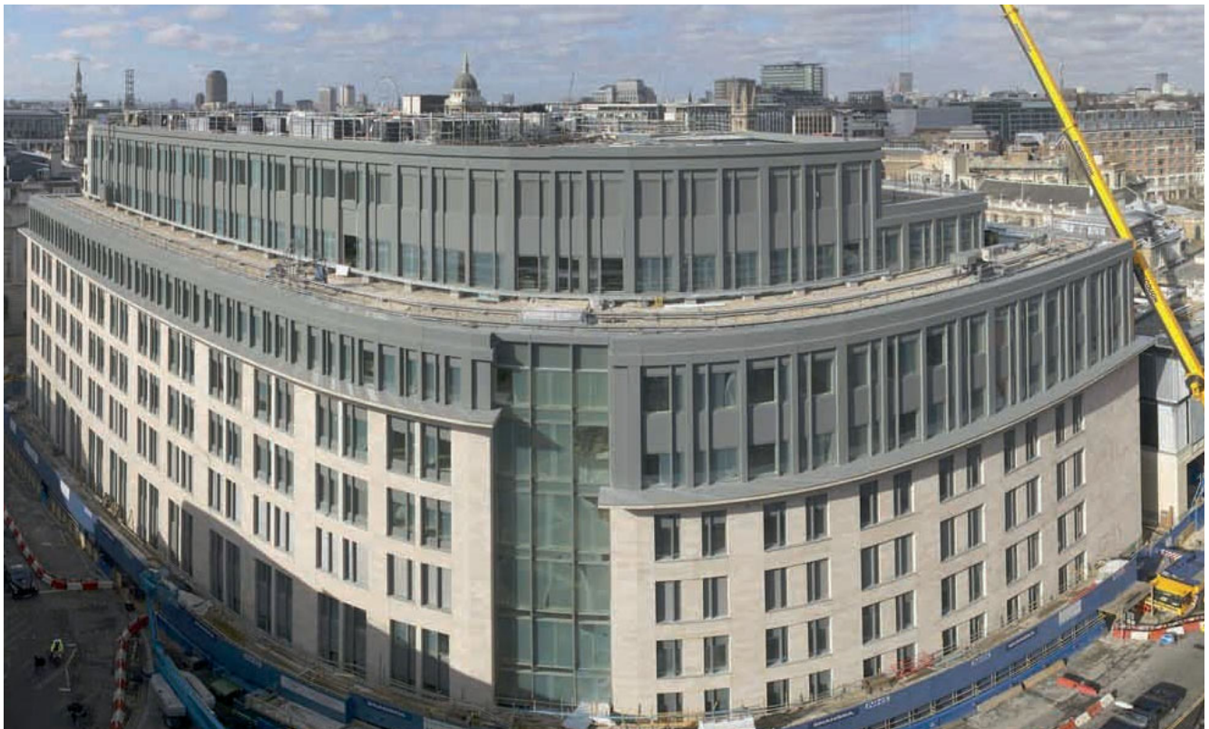
The new facility being built at St Bartholomew's Hospital in Farringdon.